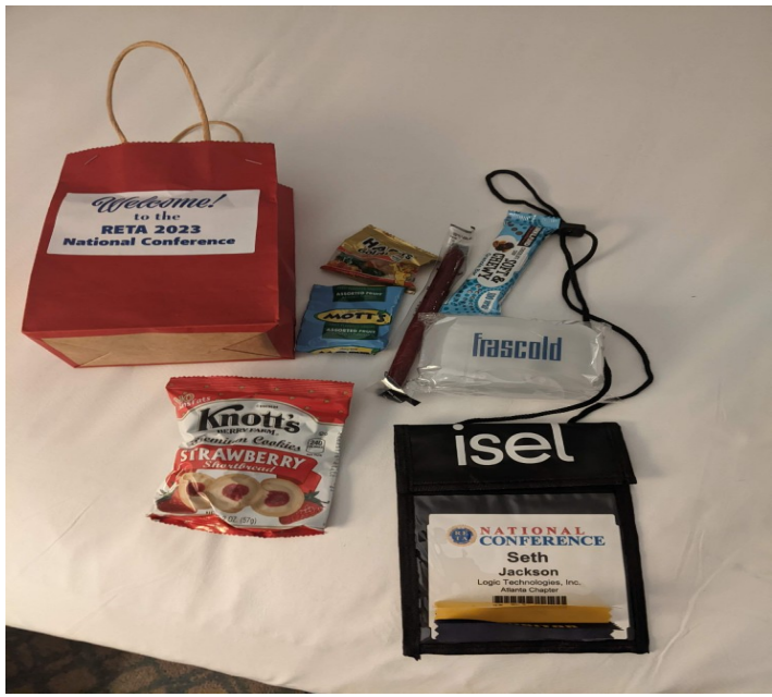
The 2023 RETA National Convention offered classes on a variety of topics in the refrigeration industry as well as exhibits of the latest products.